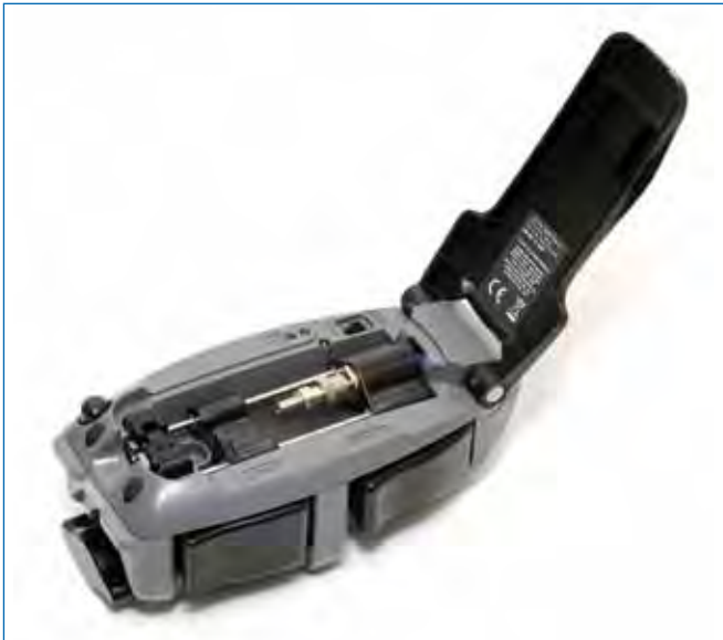
UniCam High-Performance Installation Tool | Photo LAN1904