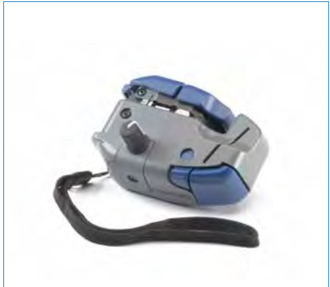
Pretium Cleaver | Photo LAN805